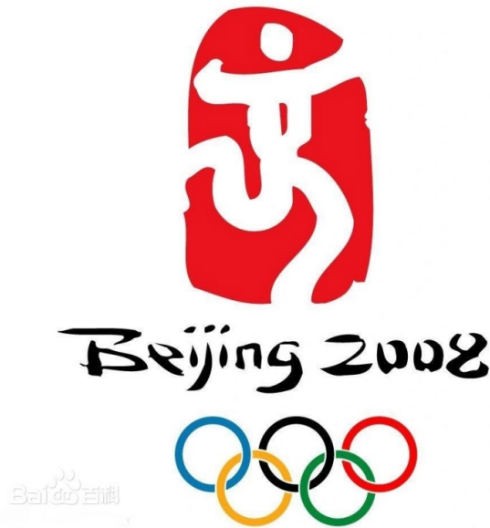
Figure 2. 2008 Beijing Olympic Games Emblem,Image source :Baidu Encyclopedia