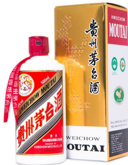
Figure 3. Moutai packaging

values of its products, but also shows the charm of Chinese calligraphy art to global consumers, establishes a unique brand image, and promotes the spread of Chinese culture. Through the clever application of calligraphy elements, the packaging design of Moutai successfully integrates traditional culture with modern design, enhances the visual appeal of the packaging, and gives the brand a deep cultural connotation. This design case shows the great potential of traditional calligraphy in modern product packaging, and provides a valuable reference for other brands in inheriting traditional culture and enhancing brand value. Through the use of calligraphy art, Moutai has not only maintained its leading position in the domestic market, but also won wide recognition and praise worldwide.